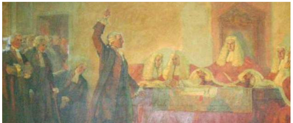
James Otis argues before the Superior Court of Massachusetts

Prior to the drafting of the United States Constitution, several states drafted declarations of rights that included prohibitions of general warrants and searches. The Virginia Declaration of Rights from 1776 read, "General warrants, whereby any officer or messenger may be commanded to search suspected places without evidence of a fact committed, or to seize any person or persons not named, or whose offense is not particularly described and supported by evidence, are grievous and oppressive and ought not to be granted." 5